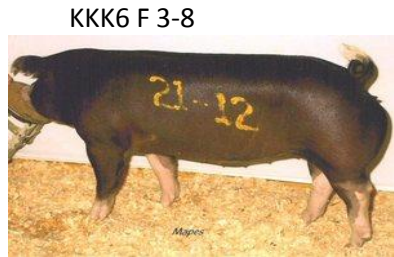
Dam of 2008 IllinoisRes Champ Gilt and granddam of 2008 WPX Champion Gilt